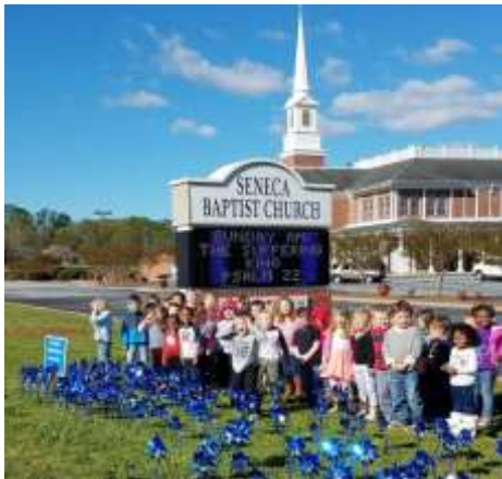
25 churches, of all dominations, also planted “Pin Wheel “Gardens across our county.