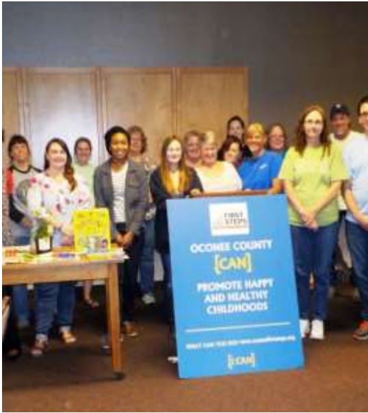
Child Care staff after “Experiencing Gardening with Young Children” Training during National Week of the Young Child.