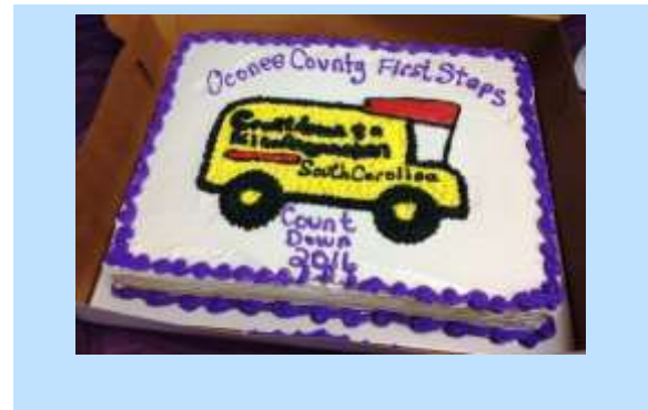
James M. Brown Elementary School Countdown to Kindergarten Children & Families Really Enjoyed the Graduation Cake.

*CTK program data is for June-August 2016, whereas CTK fiscal data includes expenditures from July 1, 2016 through June 30, 2017.