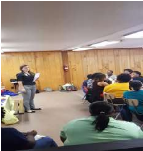
Childcare training, April 2017