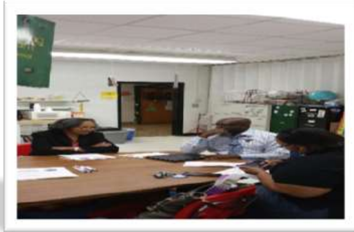
MCFS Board Members

Marlboro County First Steps, Marlboro County School District, and Marian Wright Edelman Library continue to collaborate for the children and families of Marlboro County by hosting events throughout the year.