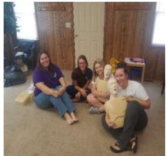
Having fun in CPR training!