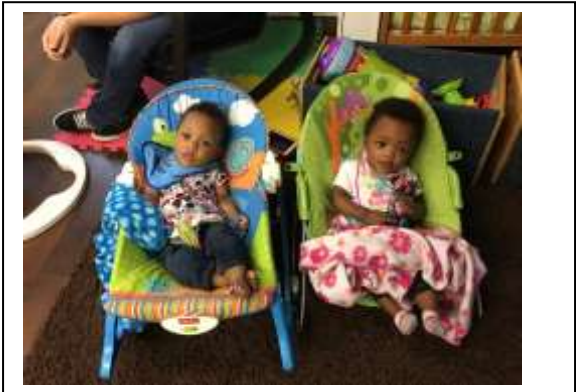
These twins entered our program in August 2016; joining their big sis who came to us at birth and will age out in June 2018.