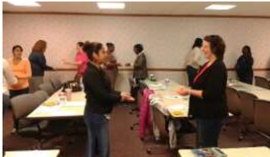
Child care providers working together during a Saturday morning child care training.