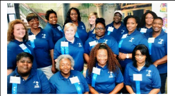
2017 TEAM Lowcountry Conference Planning Committee & Staff