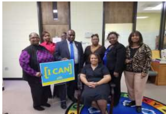
Kershaw & Lee County First Steps partnered to host staff development trainings