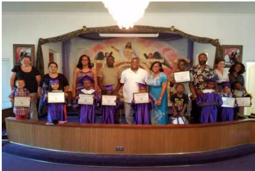
Kershaw County First Steps celebrated 9 families graduating from the Parents As Teachers Program

Support Kershaw County First Steps today through a tax-deductible donation, or volunteer.