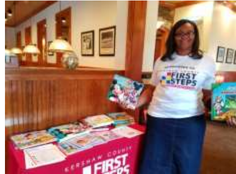
Kershaw County First Steps Board of Directors and Camden Alumnae Chapter of Delta Sigma Theta Sorority, Inc. partnered to distribute books