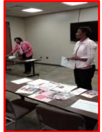
Presenter discussing the importance of monthly breast exams.