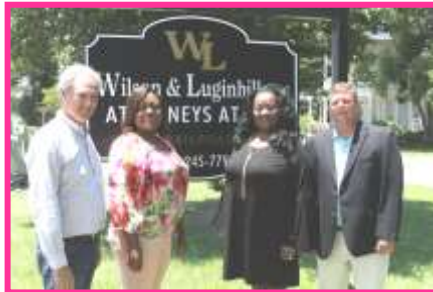
Bamberg County Attorneys Wilson & Luginbill are major flagship supporters of the 1000 children who receive high quality support from the Annual Back to School Bash! They have supported BCFS for 17 years!!