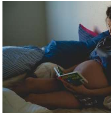
Learning begins prior to birth.

York County First Steps is the implementing agency for Nurse-Family Partnership in Chester, Lancaster, and York County.