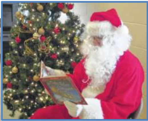
Santa reads a book at Story Time