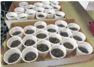
Preschoolers planted seeds at Springtime Story Time

First Steps leads Preschool Story Times in Union County throughout the year. The public is invited to bring their preschoolers to the Community Center in Union for a time of reading and making crafts. Child care centers often use this as a type of “field trip” for their classes also. Each child leaves with a book and a craft to take home!