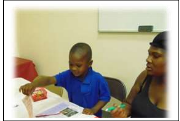
Parents Night at St. Paul Housing Complex

Eligible children receiving scholarships also participate in Early Steps to School Success.