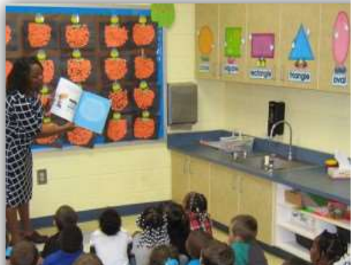
Read for the Record in Orangeburg Consolidated District 4

Children who register with Orangeburg County First Steps receive one book per month by mail through the month of their fifth birthday. Each book is carefully selected by a committee of educational specialists.