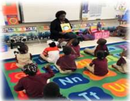
ESS Home Visitor participating in Read for the Record

21.5% ... Low birthrate 31.3% ... Parental or caregiver depression 21.5% ... Were teen parents