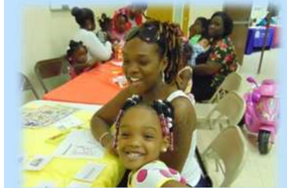
Parent/Child Group Meeting