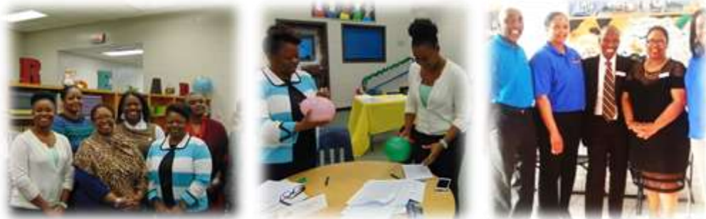
Orangeburg County First Steps Partnership Board, 2015-16

Orangeburg County Board of Directors takes great pride in supporting Orangeburg County First Steps. This Board of Directors actively participates in serving the children of the county by assisting in various activities such as literacy days, annual fundraisers and Community Day 2015-16. It is a continuous goal to strive for excellence through education and service, therefore in collaboration with South Carolina Association for Nonprofit Organizations, the board of Directors received quality board development that shared information on how to fulfill our duties as members of the board. Moreover, our efforts are furthered as we actively fundraise so that children can receive quality care through scholarships, purchasing of books and materials so that all children regardless of socio-economic status can receive early exposure to the academic environment. We wholeheartedly intend to continue to serve the children of Orangeburg County with passion and excellence.