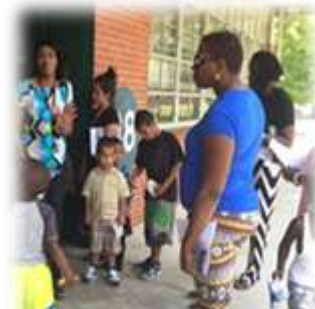
CTK students and parents participating in a tour of the school.