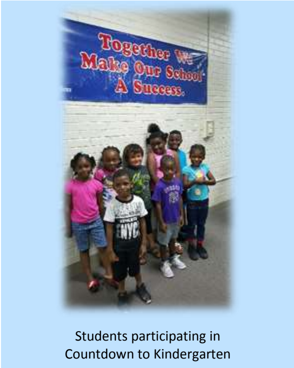
Students participating in Countdown to Kindergarten

*CTK program data is for June-August 2015, whereas CTK fiscal data includes expenditures from July 1, 2015 through June 30, 2016.