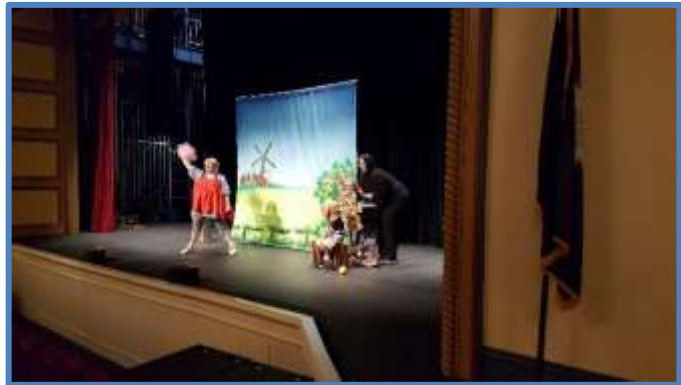
Newberry County preschoolers enjoyed Porkchop Production’s, “Bremen Town Musicians” during the Week of the Young Child.

“Our daughter is always excited to receive a new book from school. She “reads” it to us before she asks us to read it to her. The new stories encourage her to go back and look at the old ones. Many, many thanks for encouraging children to love books.” Preschool Parent