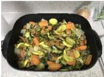
Parents with children in the Early Head Start Program, enjoy a stir-fry at their parent meeting, "How to prepare a nutritious meal on a budget."

We are enjoying having the Early Head Start Program at Newberry Child Development Center. It has not only benefited our facility through giving low income families a chance to have an early start on education, but also has enabled NDCD to help build Newberry's community brighter one child at a time. The program has allowed us to create lasting partnerships with parents and their children. The program also provides great resources for our parents and their families. We are privileged to have this program in our facility. Thank you!