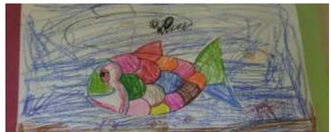
Britton's Neck Elementary student draws a picture of her favorite book.