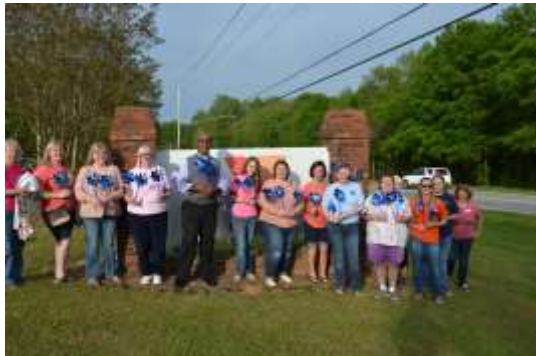
Before a training session: participants outside the Laurens Y “planting” pinwheels during the Week of the Young Child 2016