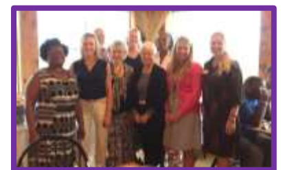
GCFS Board Members at the 2015 Annual Meeting