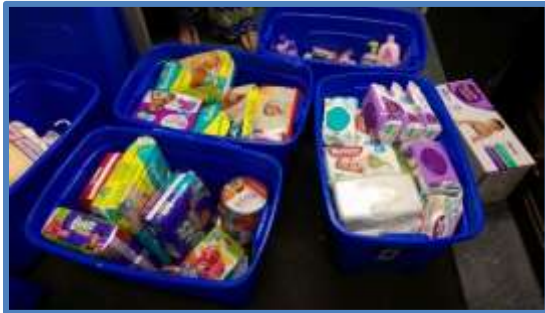
Donations from Hartsville Chamber's Women in Business event

South Carolina Diaper Bank (formally known as Mom4Moms)