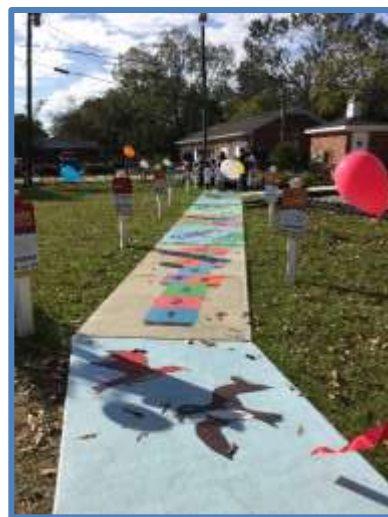
The Born Learning Trail in Pride Park

Support Darlington First Steps today through a tax-deductible donation, or volunteer.