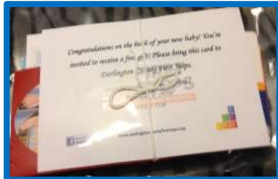
Welcome Baby Bag Envelope

Thank you to the 2015 Greater Hartsville Chamber of Commerce's Women in Business Committee for the donation of baby items, wipes, and diapers. These donations were used for Welcome Baby Bags and our parent services.