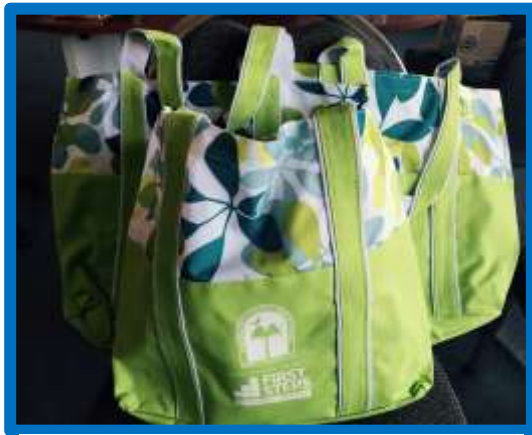
Welcome Baby Bags

Upon being discharged from the hospital, mothers receive a diaper bag that contains wipes, parent literature, growth charts, milestone booklets developed by the Born Learning Campaign, library card forms, and two books- one from DC First Steps and one from Darlington Library System. There is also a “gift card” inside that invites parents to DC First Steps’ office to receive an additional gift. Gifts are composed of wipes, diapers, linens, bottles, baby shampoos, lotions, and baby clothing. This strategy allows us to speak one on one to parents about services that are provided through the organization and how they can utilize them.