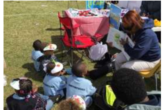
Motheread facilitator reading to children during Week of the Young Child Celebration