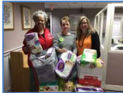
Donations from SPC Credit Union