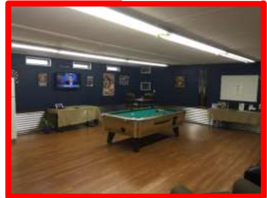
The featured area of the Dad Cave