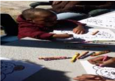
Xavier draws and colors pictures during Literacy Saturday in Summerton, SC.

"When I grow up, I want to be a plumber. I will need a wrench. I will get paid $5 a day. I am going to buy a real car. Being a plumber is going to be awesome."