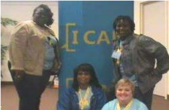
T eachers E ducators A dvocates M entors Together "We Can"