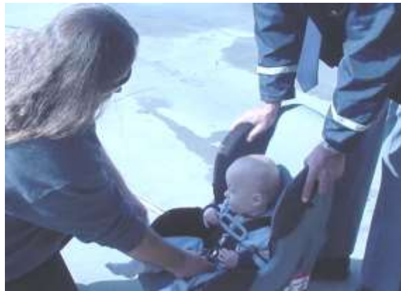
Buckle Up! Helping keep our children safe on the highway.