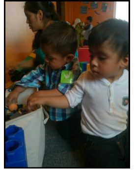
CCFS PAT client children at the program’s “End of the Year Celebration.”

At the conclusion of program year, PAT families and parent educators participate in an “End of the Year Celebration”. For this year’s festivities, CCFS partnered with Children’s Museum of the Lowcountry and families came to explore the library, have a picnic lunch, and join in fun activities with other PAT families. With a successful program year behind them, CCFS certainly has a lot to celebrate, and they look forward to continuing to equip Charleston county parents with knowledge and resources to prepare their children for a stronger start in life and greater success in school.