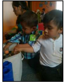
CCFS PAT client children at the program's "End of the Year Celebration."

At the conclusion of program year, PAT families and parent educators participate in an “End of the Year Celebration”. For this year’s festivities, CCFS partnered with Children’s Museum of the Lowcountry and families came to explore the library, have a picnic lunch, and join in fun activities with other PAT families. With a successful program year behind them, CCFS certainly has a lot to celebrate, and they look forward to continuing to equip Charleston county parents with knowledge and resources to prepare their children for a stronger start in life and greater success in school.