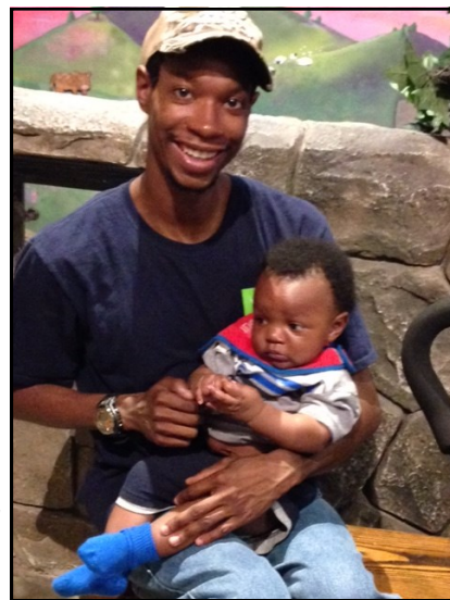
A father and child who participate in CCFS' PAT program.