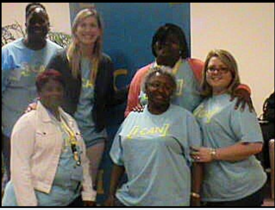
Attendees and organizers of the T.E.A.M. Lowcountry Early Education Conference wear [I Can] t-shirts.

On Friday, April 15<sup>th</sup> and Saturday, April 16<sup>th</sup>, the 11<sup>th</sup> annual Teachers, Educators, Advocates, and Mentors (T.E.A.M.) Lowcountry Early Childhood Conference took place in Ridgeland. The conference is the result of a collaborative effort by Beaufort, Jasper, Hampton, and Allendale County First Steps, along with SC Child Care Resource and Referral, Head Start, SC Department of Social Services (DSS) ABC Program, and Ridgeland Baptist Child Care Ministry. Other participating organizations included Hope Haven, SC Child Care Inclusion, and the T.E.A.C.H. Early Childhood Scholarship Program. Focusing on the development of early childhood programs, this