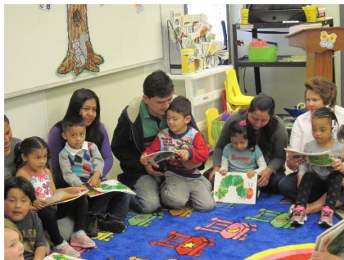
Parents, children, and teachers work together in their classroom.

"With my Family Literacy and PAT friends, I have learned just because you are a single parent does not mean you have to raise your child all by yourself. There are people who want to help you do good and be a good parent."