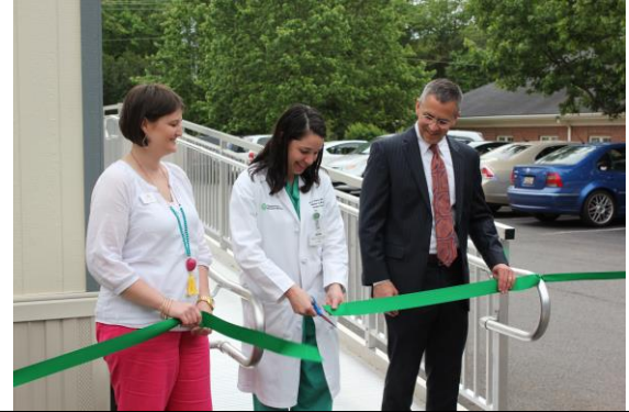
Staff from Greenville First Steps, Greenville Health System, and the YMCA at the ribbon cutting for the new childcare building for CenteringPregnancy

CenteringPregnancy is a CenteringPregnancy® is group prenatal care. Greenville First Steps partners with Greenville Health System and the YMCA of Greenville to fund a childcare center on site at the OB/GYN clinic. Too many mothers who already had children were unable to participate in CenteringPregnancy due to lack of childcare. By offering free childcare during sessions, more mothers are able to receive quality, group based prenatal care.